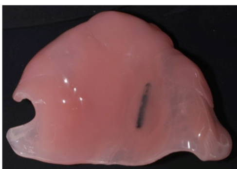
Fig. 1 - Channel for the T-microchip transponder