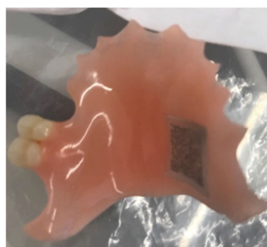
Fig. 2 - Cavity QR codes plaques