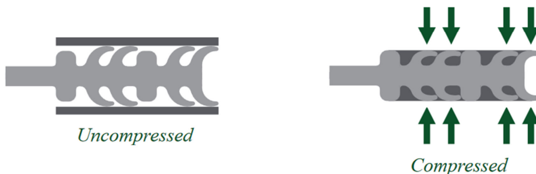
Fig. 2 - Application of inventive principle #1 segmentation in a form of innovated gasket (AIGI, 2013)

In accordance with Principle #1, it is recommended "to divide an object into an independent part or increase the fragmentation of an object". An example of the use of this inventive principle is, for example, an innovated type of gasket with graphite coated ( or PTFE coated) round edged beveled metal ribs when compressed create separate sealing chambers that breakdown system pressure across the gasket face (Figure 2). This gasket (AIGI, 2013) is, as compared to traditional shapes, able to provide better sealing properties. The seals are formed in the form of a "bridge", even after compression, and in this case they also create a continuous sealing surface. Individual ribs of the seals tend to "open" under the pressure of the media to reduce its leakage.